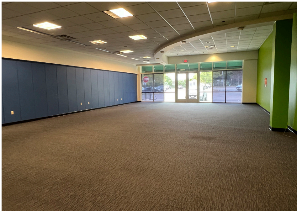
Interior space, facing front entrance